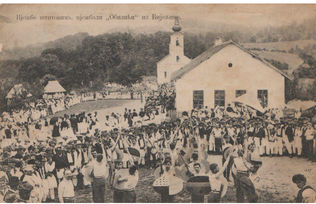
Members of Soko from Bijeljina, 1911