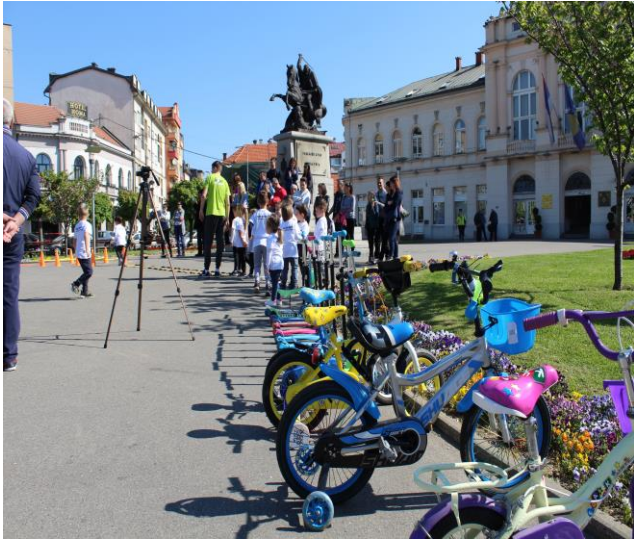
d) How does the City encourage voluntary participation in sports?