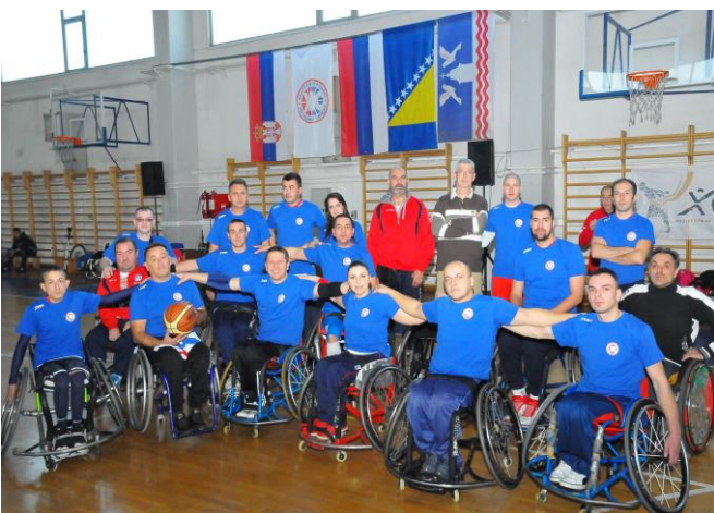
➤ d) Is there an initiative to promote integration through sport?

NGOs by applying for projects financed from the City budget receive funds for affirmation and inclusion of children from socially vulnerable families through the use of sports activities to take advantage of all benefits of such engagement. The city of Bijeljina also signed a contract with Association Otaharin that gathers the Roma population on free sports improvement and practicing sport. Also, through program co-financing, Bijeljina supports sports activities of associations dealing with children with special needs.