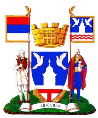
City of Bijeljina – European City of Sport 2020 candidate