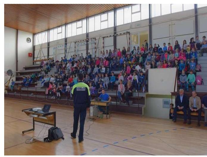
Sports hall Elementary school "Vuk Karadzic"