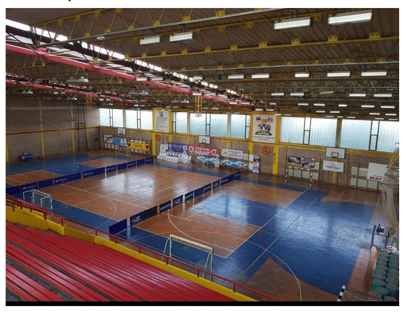
This sports facility has a sports hall, changing rooms with showers, offices and a refreshment room, and there is also a small gym on the upper level under the seating area.