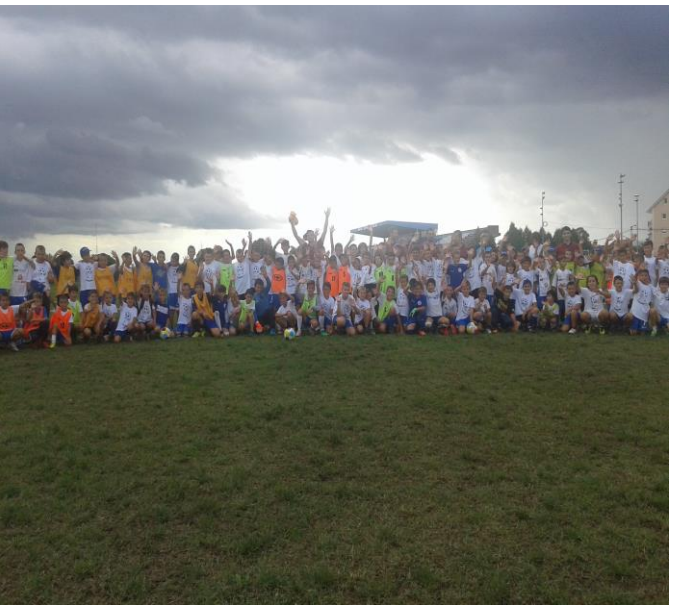
> c) Explain additional measures that the City uses to increase the number of athletes and recreational players in all parts of the population. Submit the approximate data that you believe will be achieved by the end of the candidacy period and during the candidacy.

In the Sports Development Program of the City of Bijeljina adopted by the City Assembly, one of the four priorities of this topic has been defined.