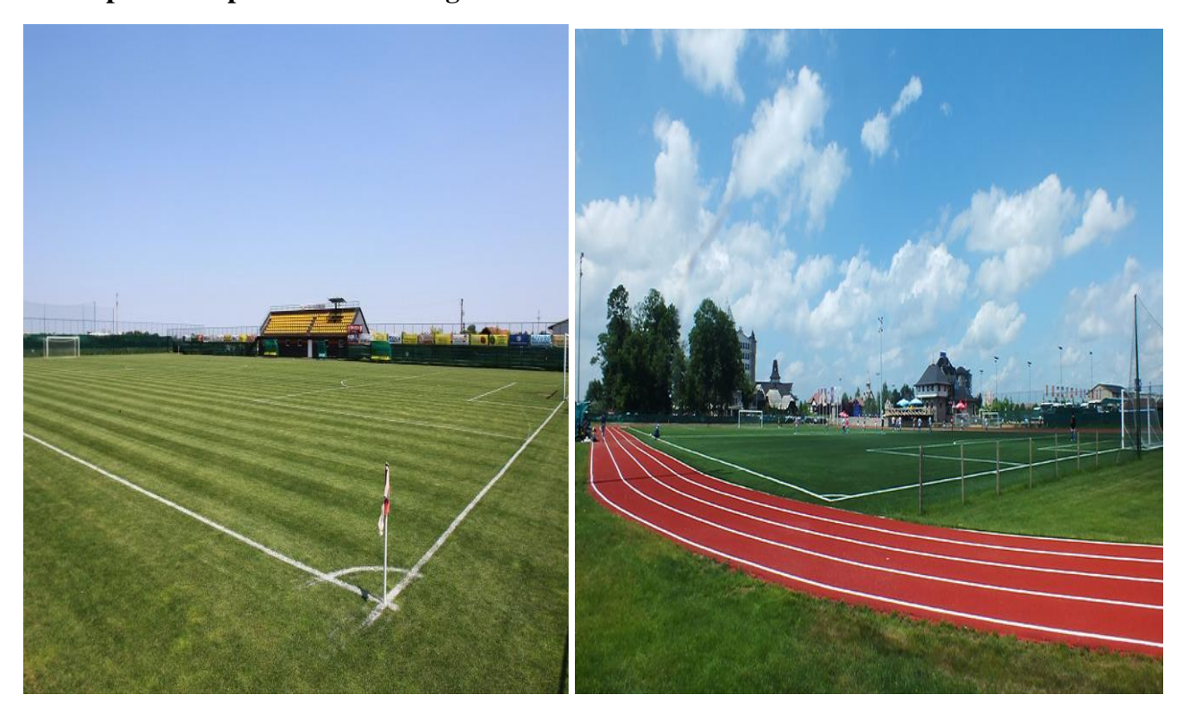
Within which there are two football turf pitches and one with artificial turf that are in exceptional condition. Also, tennis courts are part of the complex.