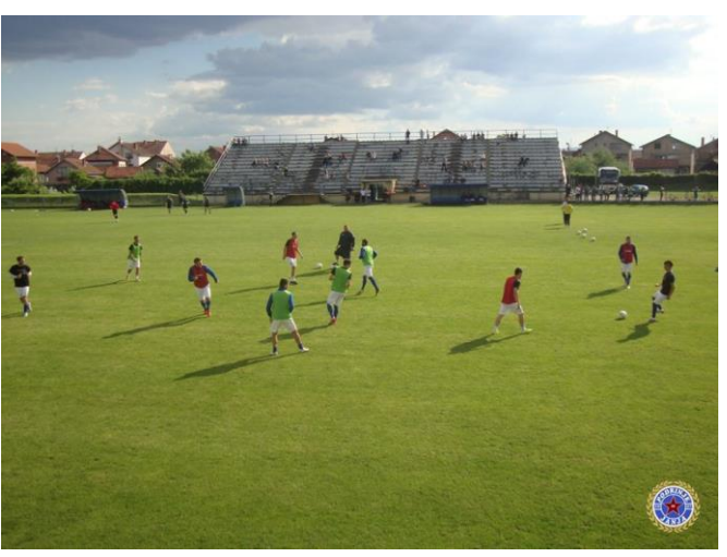
Stadium Velika Obarska